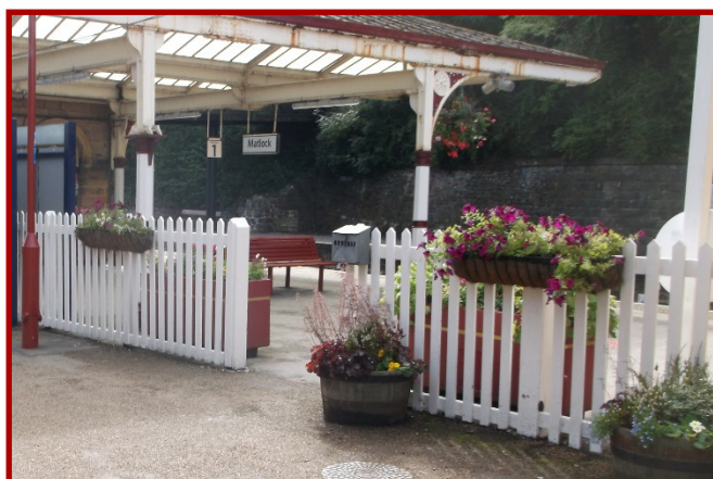
Picket fencing repainted as part of the Community Action Day

A Community Action Day was held on 15 th September, which involved the painting of the entrance fencing, benches, doors and window frames of buildings and lower section of canopy columns. Vegetation management was also carried out on the planting between the car park and rear of the platform. Staff from East Midlands Trains and Network Rail joined volunteers from Peak Rail and Station Adopters.