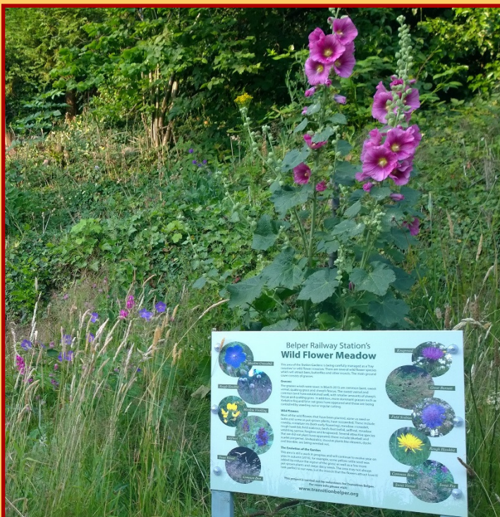
Belper Station Wildflower Meadow in Bloom