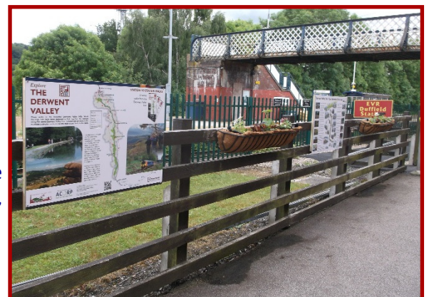
Promotional Panels at Duffield Station entrance

The illustrative panels promoting the Derwent Valley Line and the Derwent Valley Station to Station Walks have been installed at Duffield, Whatstandwell and Matlock Bath.