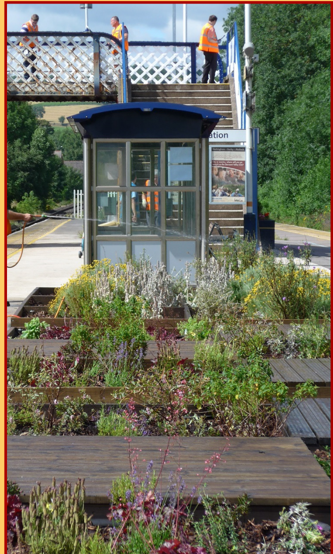
Duffield Platform decked out with new planting