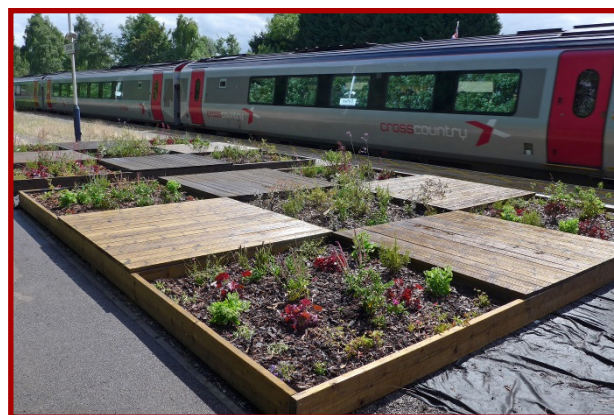
A CrossCountry Train passes the new planting feature

Duffield Station has undergone a transformation during the last 12 months, thanks to a new decking and planting feature. In June, three areas of decking were built covering an area of 120m 2 with each section comprising a number of large planting beds. These were filled with 150 bags of compost and planted with over 350 shrubs all of which were carried across the footbridge, as part of the Community Action Day on 14th July. Additionally, extensive painting of the footbridge and fencing greatly improved the overall appearance of the station. Staff from East Midlands Trains, and Network Rail, joined volunteers from Ecclesbourne Valley Railway, Friends of the Derwent Valley Line and Duffield Parish Councillors in the community improvement day.