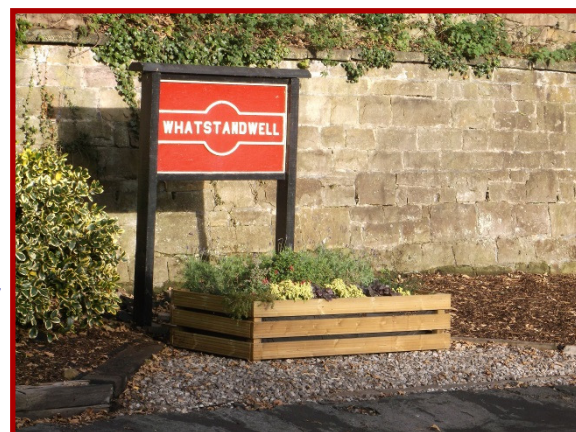
Improvements to Whatstandwell disused platform

A Community Action Day on 11 th August was well attended by staff from ACoRP, Department for Transport, East Midlands Trains and Network Rail, who worked alongside Station Adopters to enhance the station. All the post and rail fencing was stained and vegetation cut back behind the platform. Network Rail had organised access for a group of staff to cross the track under the guidance of a Controller of Site Safety. This enabled trees to be cut back and a tidy up of the disused platform, which is normally inaccessible. The area was covered with landscape fabric, a wooden planter was installed along with six barrel planters, all filled with shrubs. An ACoRP Small Grant of £180 enabled woodchip to be purchased so that Network Rail staff could complete the enhancement.