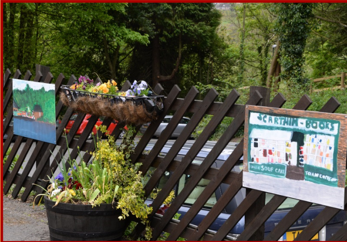
Children's Artwork at Cromford Station