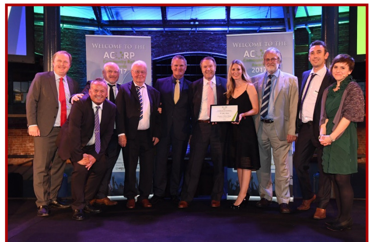
Cromford Station Group collect the 'It's Your Station' Award