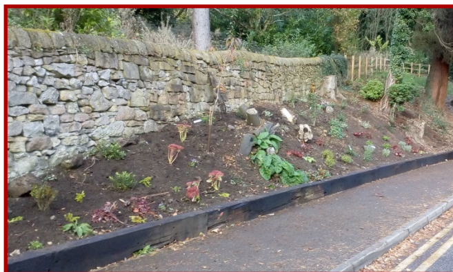
Station entrance enhanced with sleepers and planting

These have been printed onto Dibond and installed along the platform fencing to illustrate local places of interest. Funding was provided to Cromford Parish Council from Derbyshire Dales District Council's Local Projects Fund.