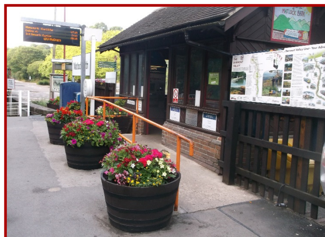
New planting barrels and Derwent Valley Line Display Panels at Matlock Bath

The Community Rail Partnership was awarded £1300 from ACoRP's Small Grants Fund to enable the purchase of new planting barrels. This funding was provided to Matlock Bath Parish Council who have ordered eight anti-vandal 'self watering' barrels, to replace their existing wooden planters, which are in need of replacement.