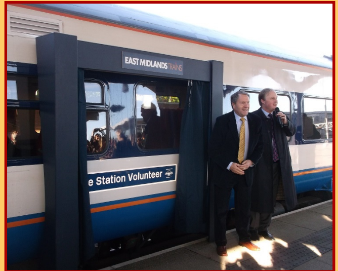
'The Station Volunteer' train naming